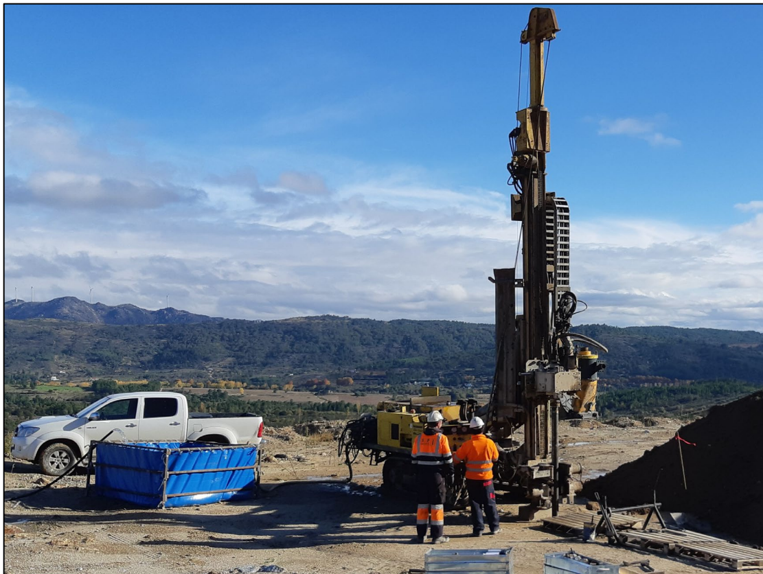
Figure 1. Track-mounted diamond core drill rig at Block 1, Alvarrões Lepidolite Mine, Portugal.

A JORC Code (2012) Table 1 Report pertaining to the 30 October 2018 Youanmi drilling results announcement is appended to this release.