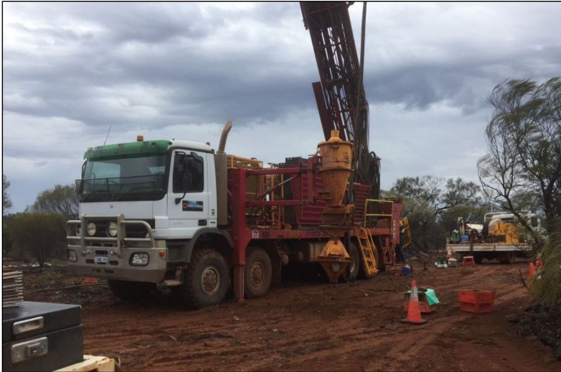
Figure 3. Setting up to drill reverse circulation hole at Youanmi.